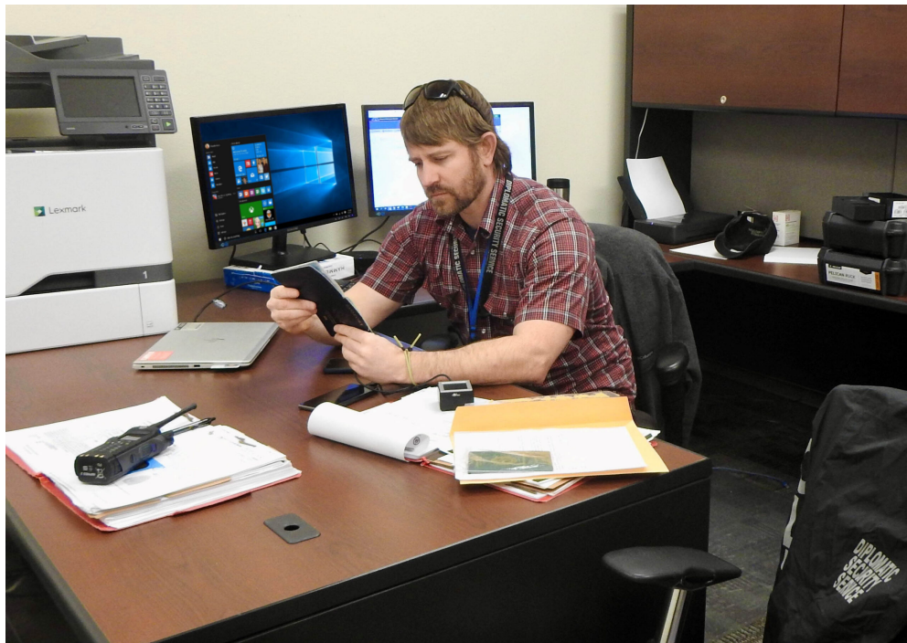
A special agent in the Diplomatic Security Service Las Vegas Pilot Office