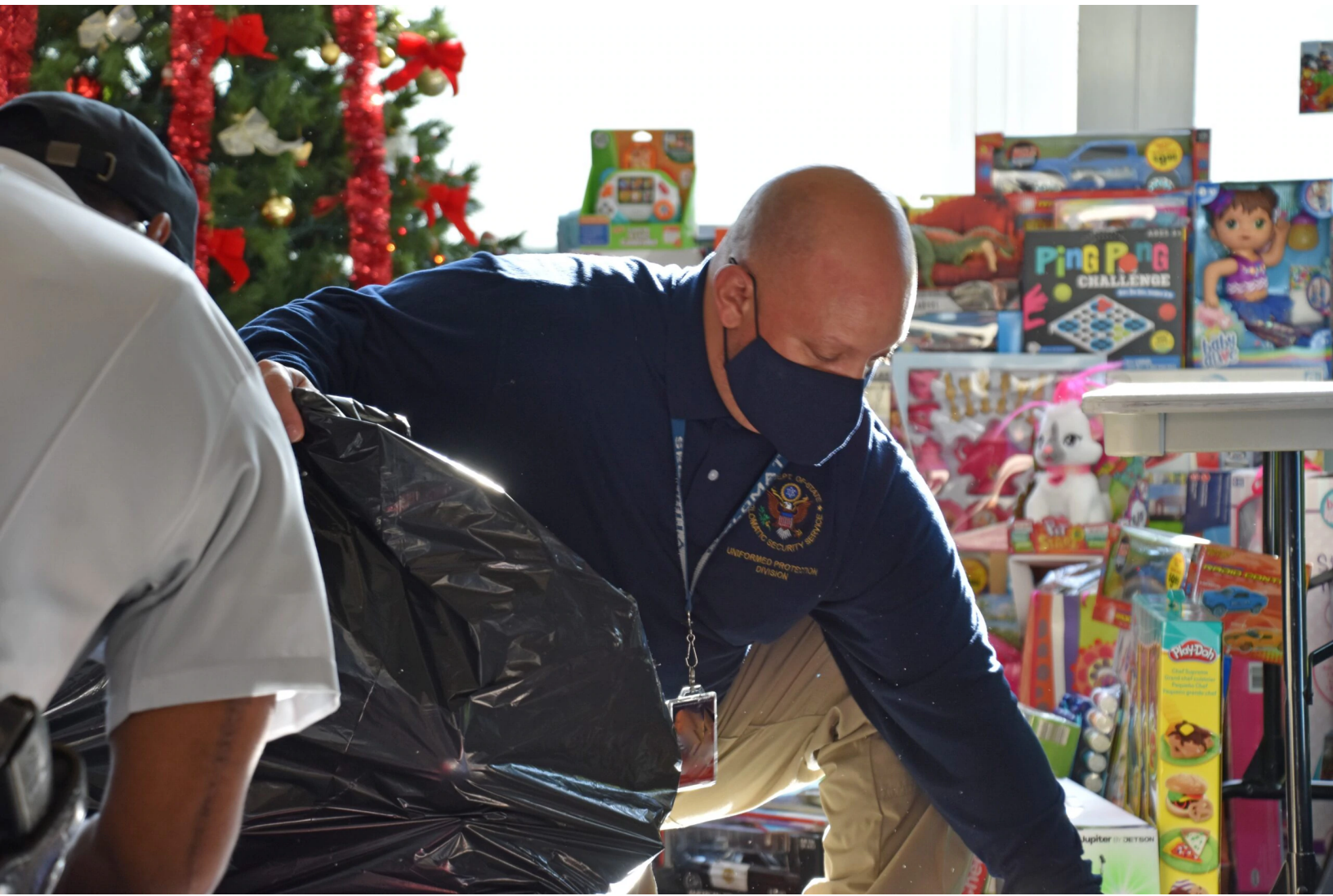
A DSS security officer packs toys collected from Department of State employees and provided to the USMC Toys for Tots program, December 17, 2020.