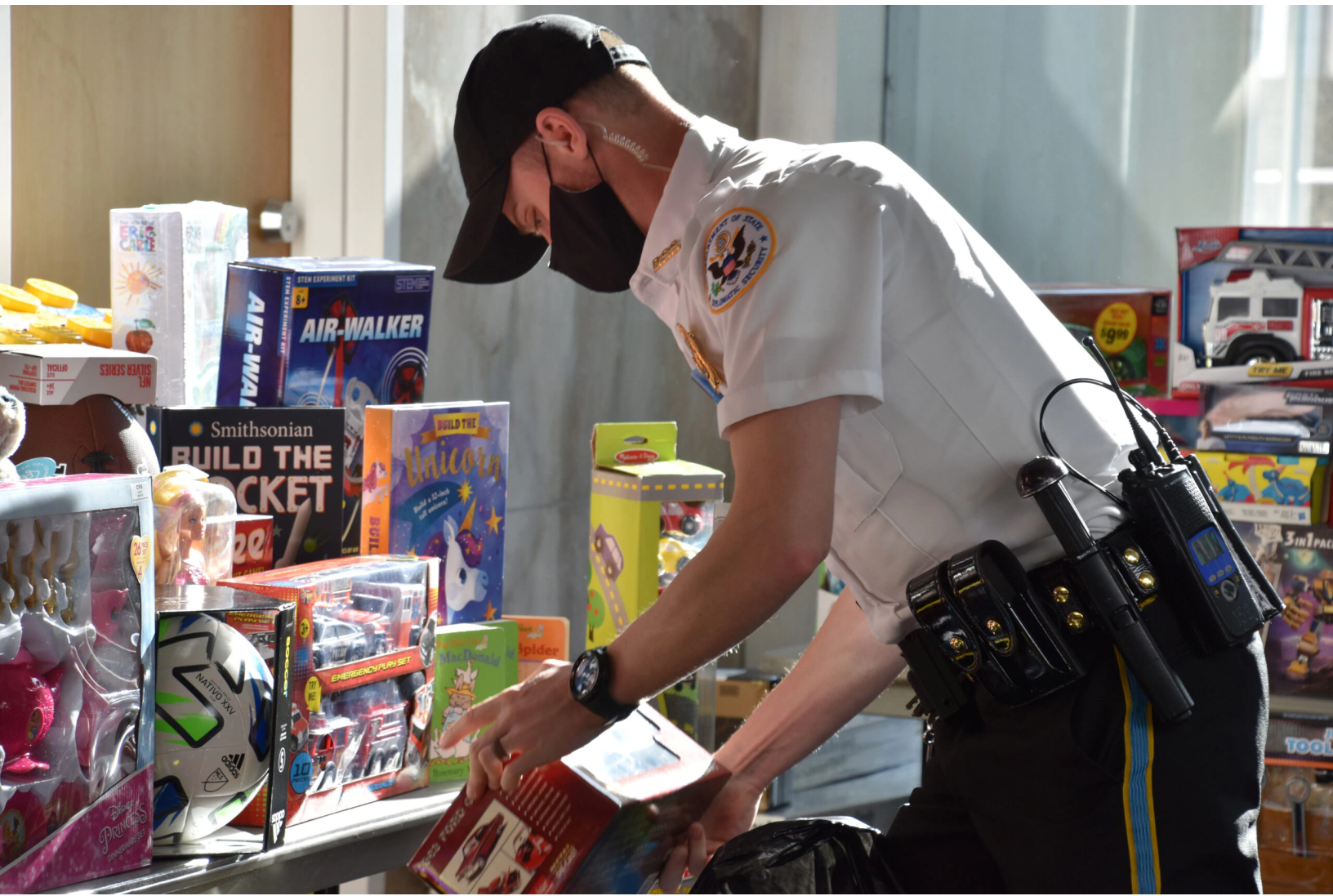
A DSS uniformed guard packs toys collected from Department of State employees and provided to the USMC Toys for Tots program, December 17, 2020.